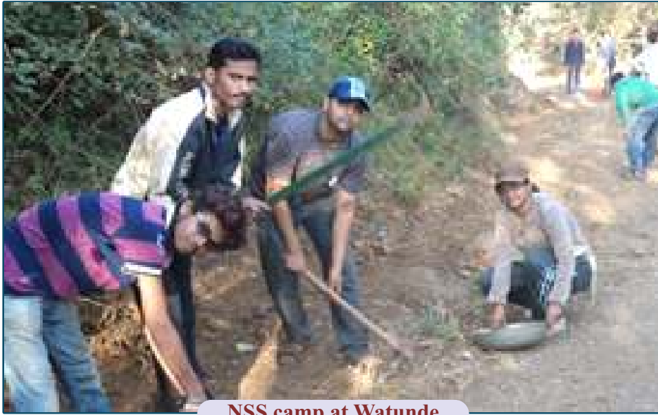
NSS camp at Watunde