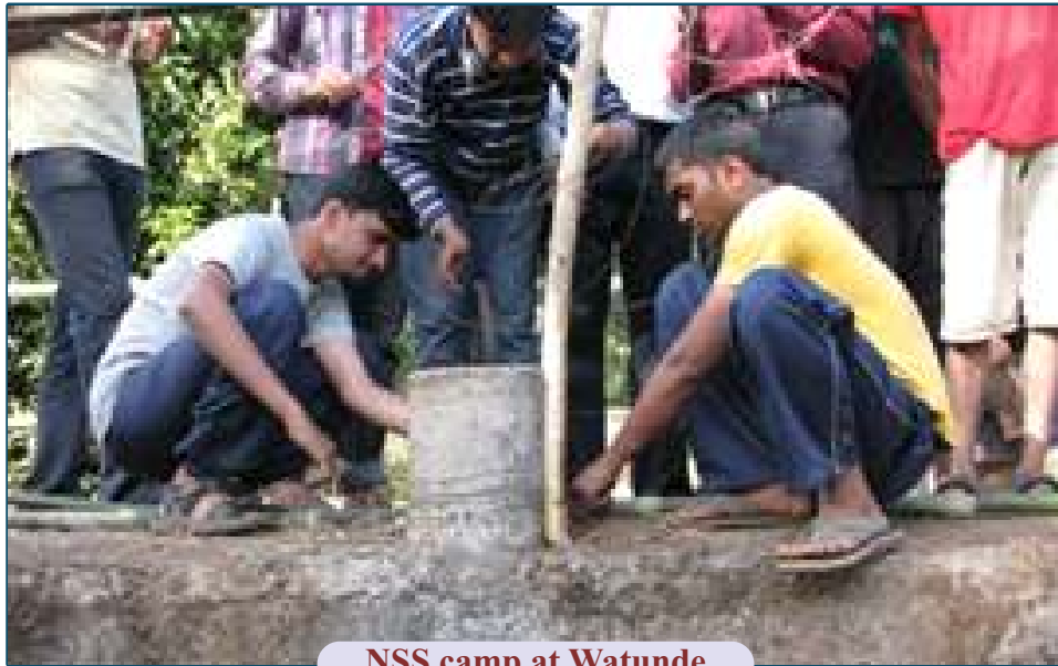
NSS camp at Watunde