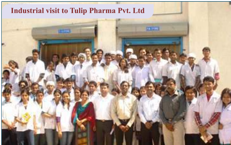
Industrial visit to Tulip Pharma Pvt. Ltd