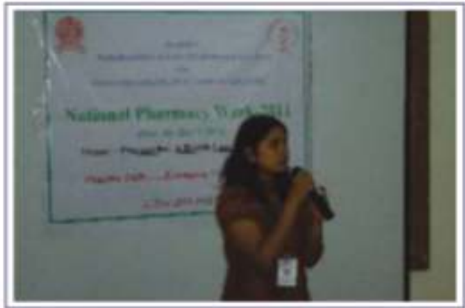
Student participant at event