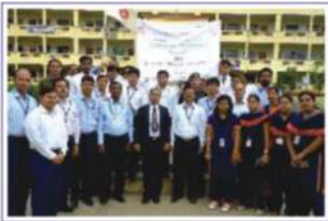
Principal & faculty at NPW rally